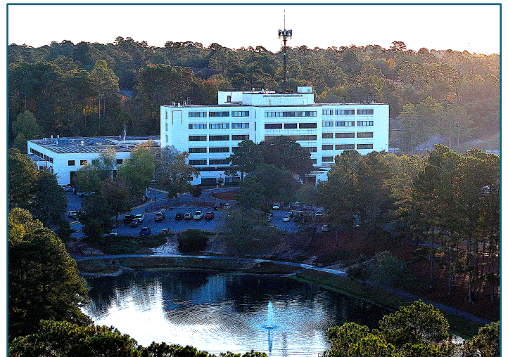
Aiken Regional Medical Centers main hospital is expanding operations through free standing emergency centers.

Reportedly, fewer than 5% of the patients treated at ARMC's Sweetwater facility need to be transported to the hospital, highlighting the value of local emergency services.