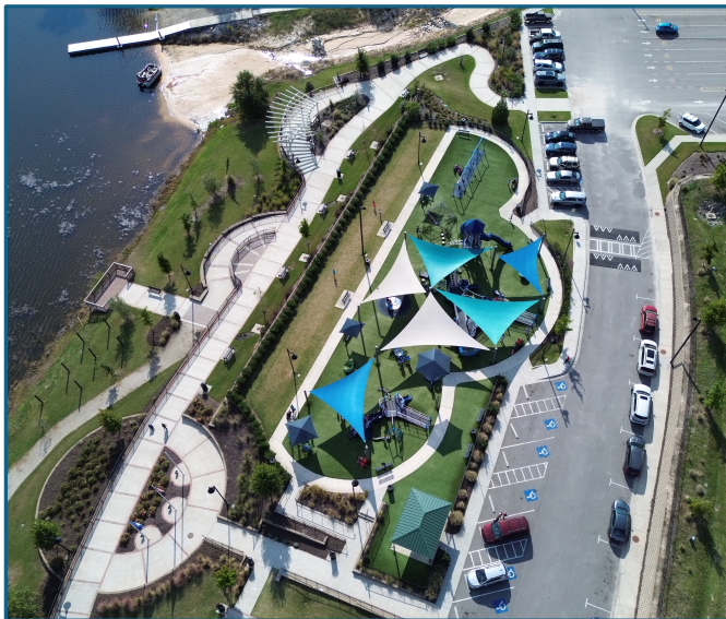
Langley Pond Park is a popular destination for rowing, swimming, fishing, and other water sports.